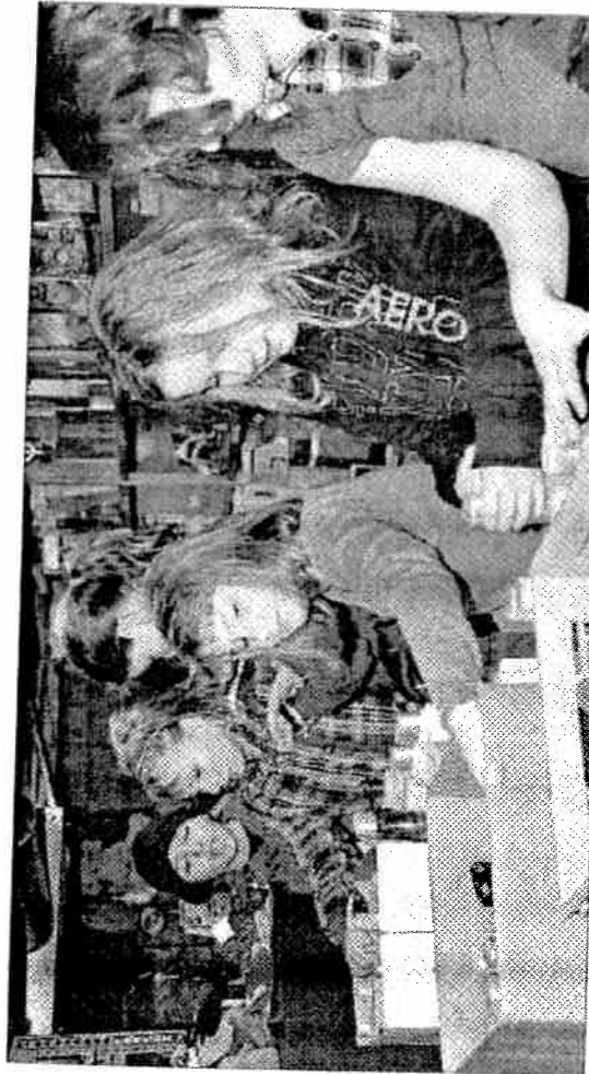
Gifted students in Kenton County School District's Project ASCENT program collected about $5,000 worth of canned goods for Welcome House in Covington. Besides doing the actual collecting of the canned goods, Kenton County students helped package and put away their donations to Welcome House Friday Jan. 29.